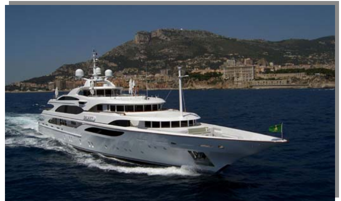
56m Benetti Galaxy

The Benetti range features the new 24 meter LEGEND , 30 meter TRADITION , 37 meter CLASSIC and the 45 meter VISION all constructed of high tech composite materials.